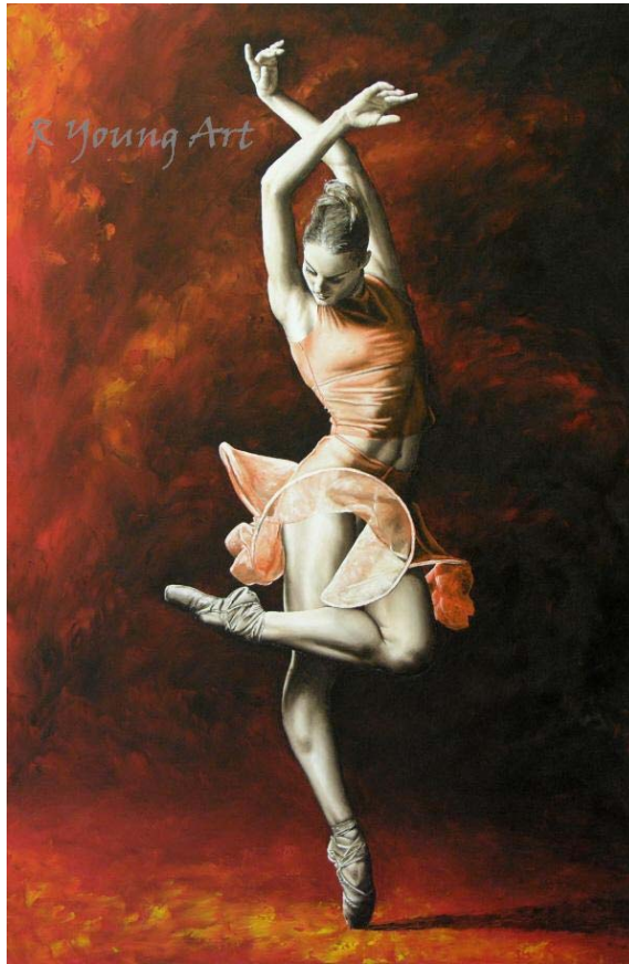
The Passion of Dance