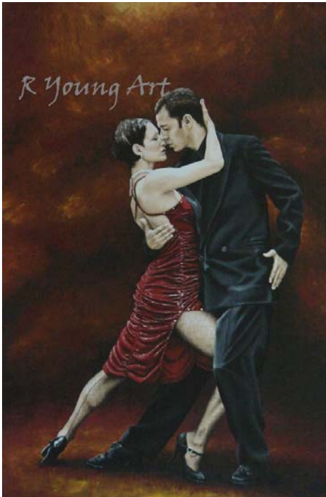
That Tango Moment