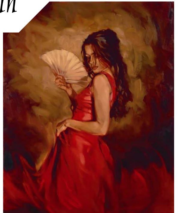
Dance of Passion